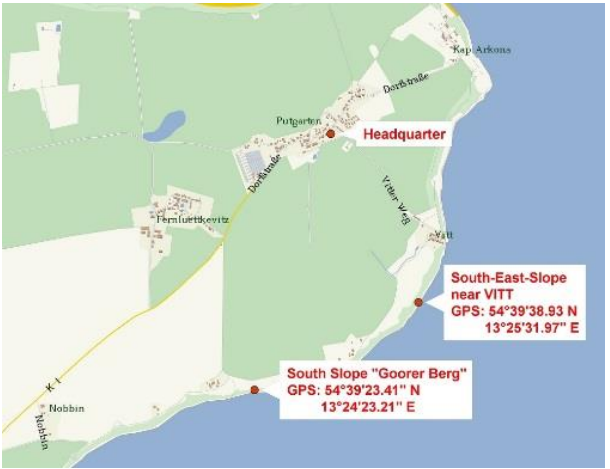
Vitt (E-SE) 1 & „Goorer Berg“ (S-SW) 2 protected area