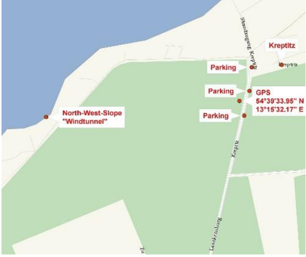
“Windtunnel“ Kreptitz (W-NW-N) 3 protected area