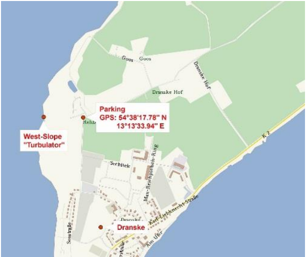
„Turbulator“ Dranske (W – SW) 4 protected area