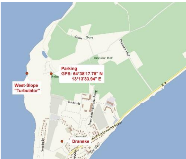
„Turbulator“ Dranske (W – SW) 4