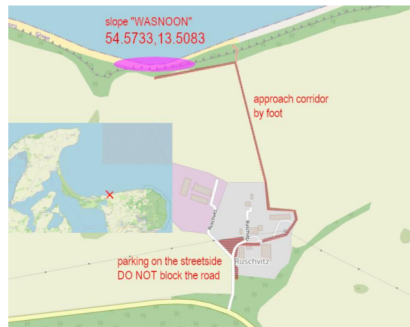
„Was Noon“, East of Glow, village of Ruschvitz