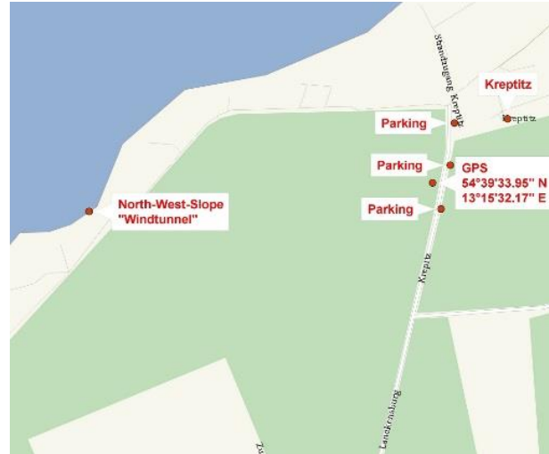
„Windtunnel“ Kreptitz (W-NW-N) 3