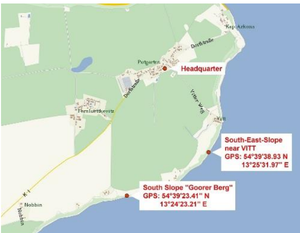
Vitt (E-SE) 1 & „Goorer Berg“ (S-SW) 2